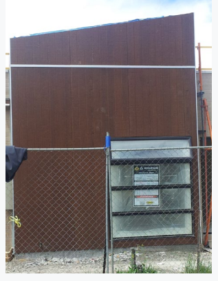
0 MONTHS: Recenlty built, this shows the beginning colour of Weathertex Natural