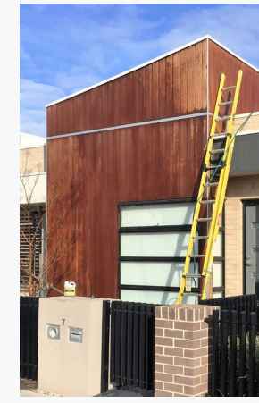
CLEANING: Wash the boards with a product like Intergrain Reviver or Cabots Deck Clean