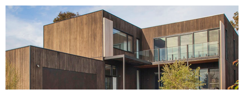
Left to weather and lighten off.

To stop the silvering off process the boards can be stained at any time which will help protect the boards from the sun, as well as allow for a new spectrum of colours. Boards can be brought back to their original dark colour by first scrubbing with a deck cleaner and then applying the appropriate coloured stain.