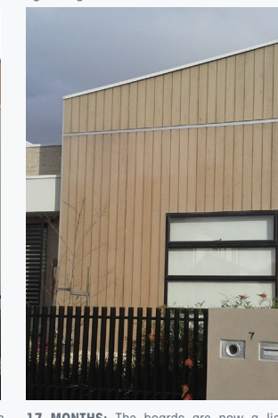
17 MONTHS: The boards are now a light blonde colour